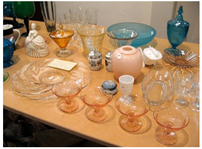
Auction Fun in November